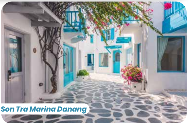
Son Tra Marina Danang