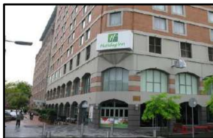
Holiday Inn DH 4 Star