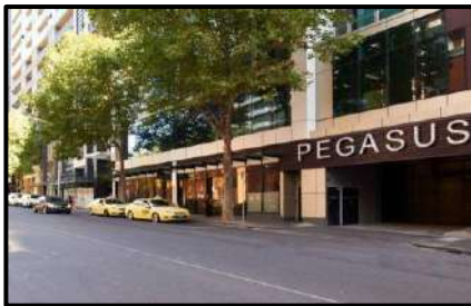
Pegasus 4 Star