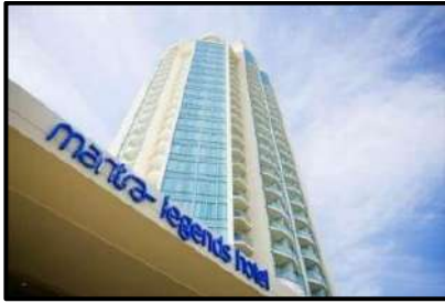
Mantra Legends 4 Star