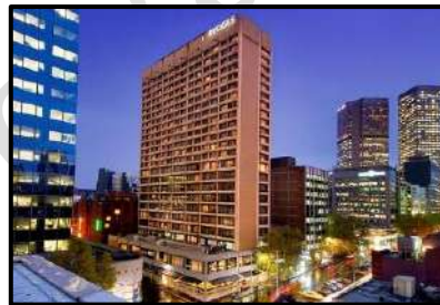
Rydges Hotel 4 Star