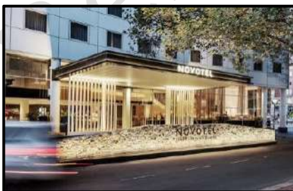
Novotel Sydney 4 Star