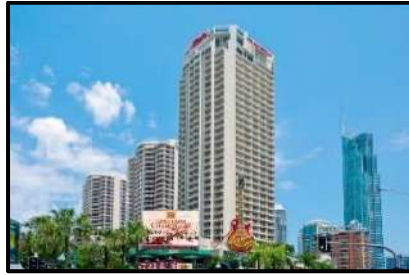
Grand Chancellor 4 Star