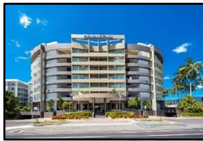
Double Tree By Hilton 4 Star