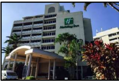
Holiday Inn 4 Star