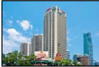
Grand Chancellor 4 Star