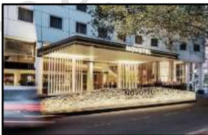
Novotel Sydney 4 Star