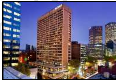
Rydges Hotel 4 Star