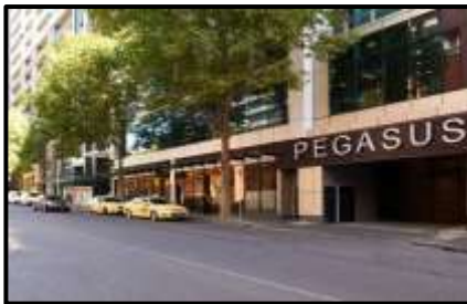
Pegasus 4 Star