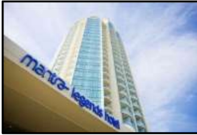
Mantra Legends 4 Star