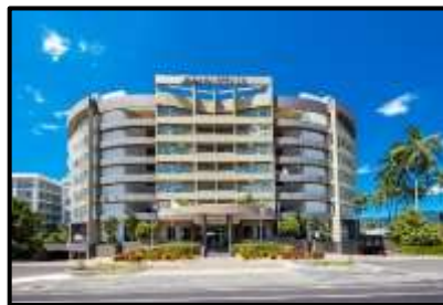
Double Tree By Hilton 4 Star