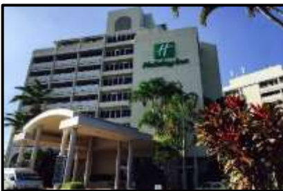
Holiday Inn 4 Star