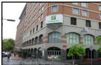
Holiday Inn DH 4 Star