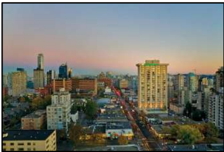
Sandman Suites Downtown