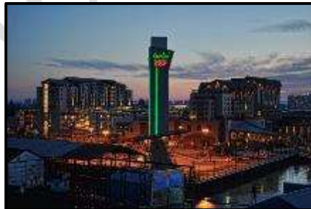
The River Rock Casino