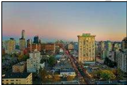
Sandman Suites Downtown