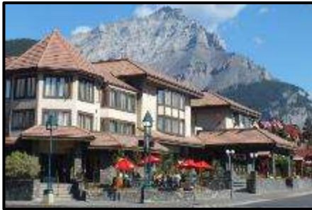
Elk+ Avenue Hotel