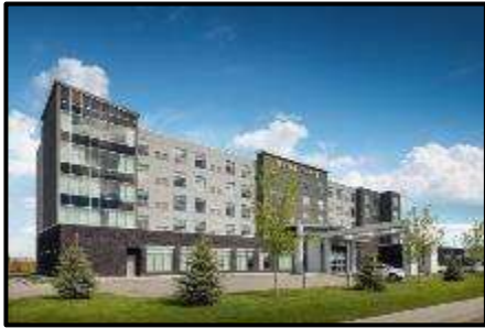
Hyatt Place Airport