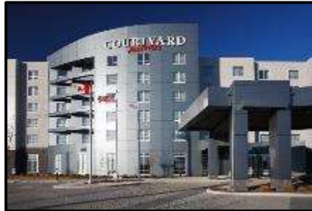
Courtyard By Marriott Airport