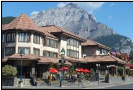
Elk+ Avenue Hotel