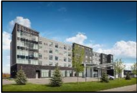
Hyatt Place Airport