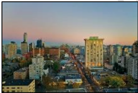
Sandman Suites Downtown