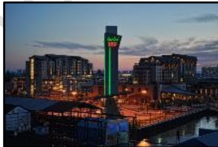
The River Rock Casino