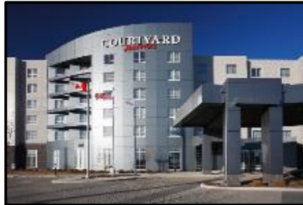
Courtyard By Marriott Airport