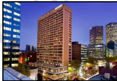
Rydges Hotel 4 Star