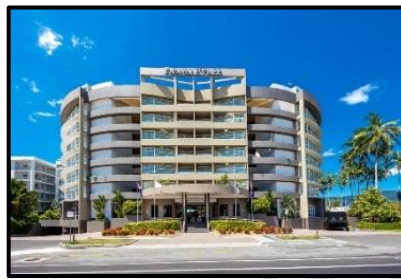
Double Tree By Hilton 4 Star