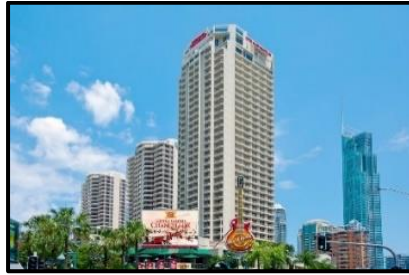
Grand Chancellor 4 Star