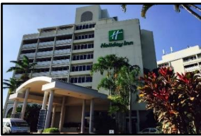
Holiday Inn 4 Star