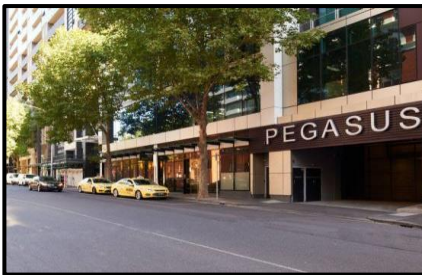
Pegasus 4 Star