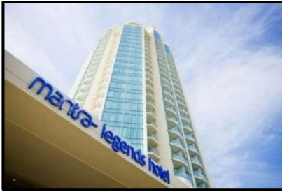
Mantra Legends 4 Star