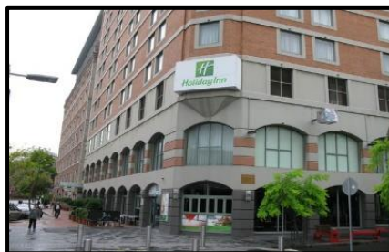
Holiday Inn DH 4 Star