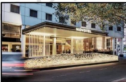
Novotel Sydney 4 Star