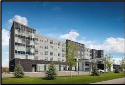
Hyatt Place Airport