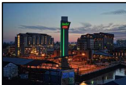
The River Rock Casino