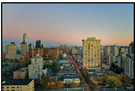
Sandman Suites Downtown