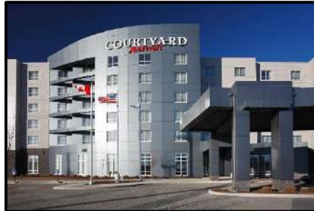
Courtyard By Marriott Airport