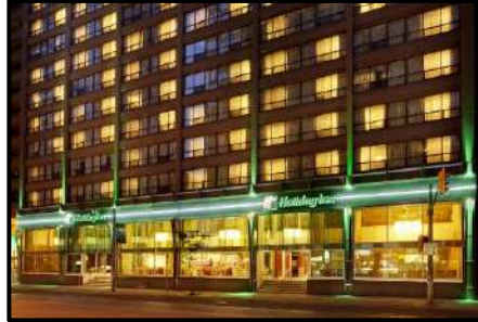
Holiday Inn Downtown