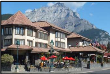
Elk+ Avenue Hotel