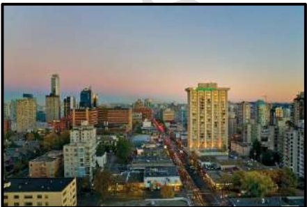
Sandman Suites Downtown