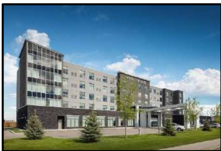
Hyatt Place Airport