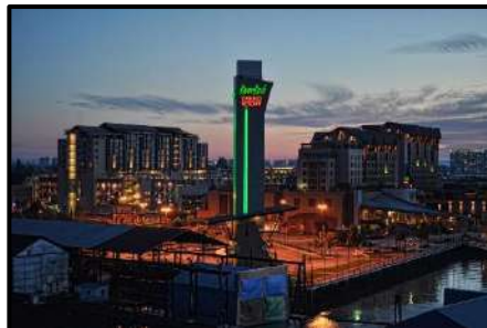
The River Rock Casino