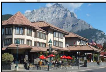
Elk+ Avenue Hotel