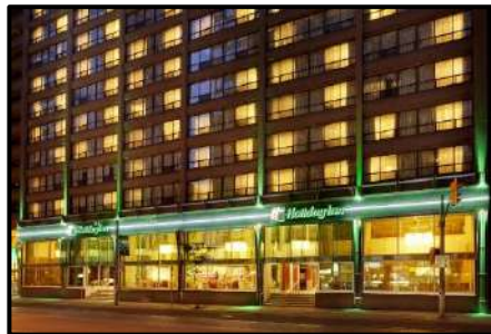
Holiday Inn Downtown