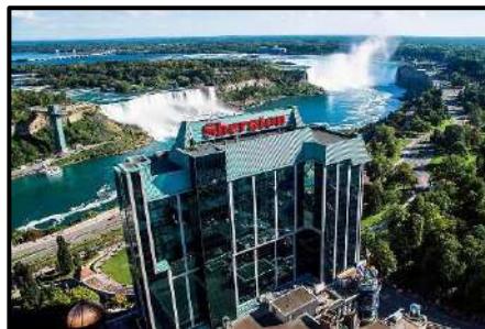
Sheraton On The Falls