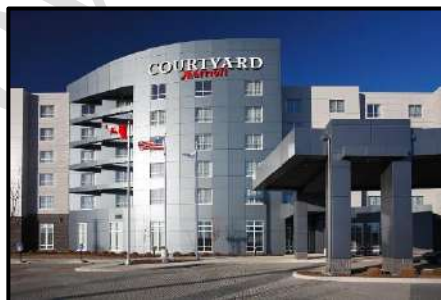
Courtyard By Marriott Airport