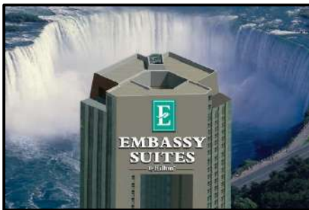
Embassy Suites By Hilton