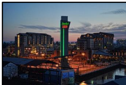
The River Rock Casino