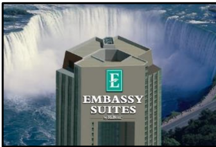
Embassy Suites By Hilton