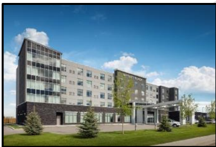
Hyatt Place Airport