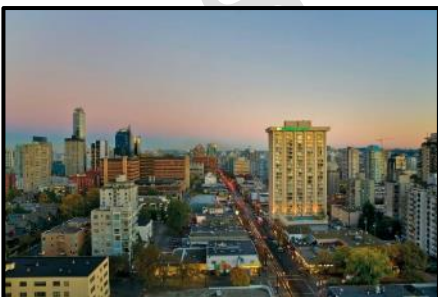
Sandman Suites Downtown