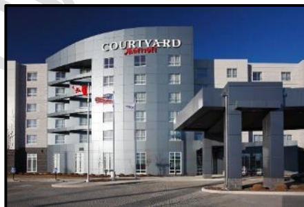
Courtyard By Marriott Airport