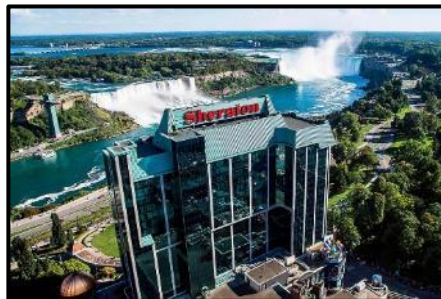
Sheraton On The Falls