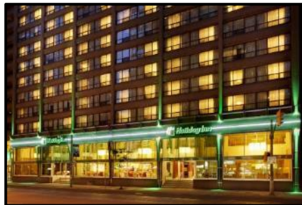
Holiday Inn Downtown