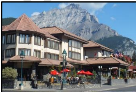
Elk+ Avenue Hotel