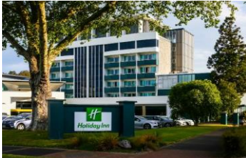
Holiday Inn Rotorua