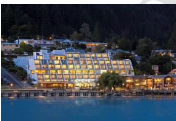
Crowne Plaza Resort