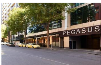
Pegasus Apartment Hotel