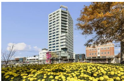
Crowne Plaza Hotel