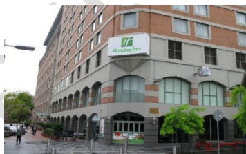
Holiday Inn Darling Harbour