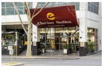
Clarion Suite Hotel