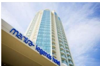
Mantra Legends Surfers Paradise