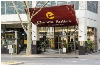
Clarion Suite Hotel