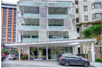
The Quadrant Hotel