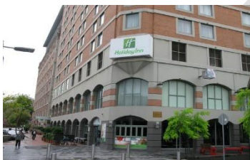
Holiday Inn Darling Harbour