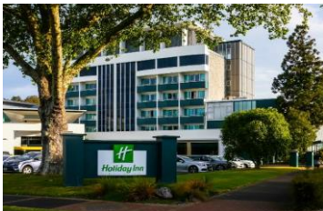
Holiday Inn Rotorua