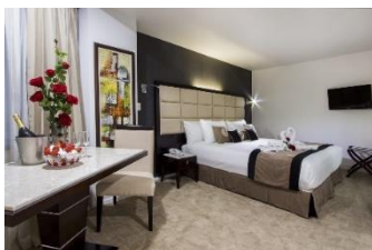
V R Hotel