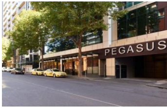
Pegasus Apartment Hotel