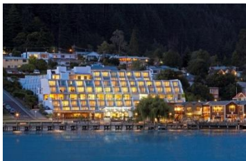
Crowne Plaza Resort