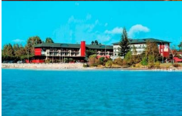
Sudima Lake Resort