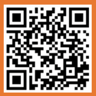
Scan QR for Traveller Reviews