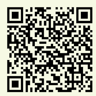
Scan QR for South Africa Tourist Visa Check List