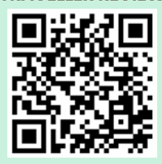
Scan QR for Traveller Reviews