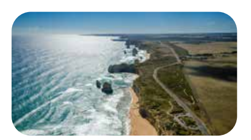
We Make Your DREAMS TRUE