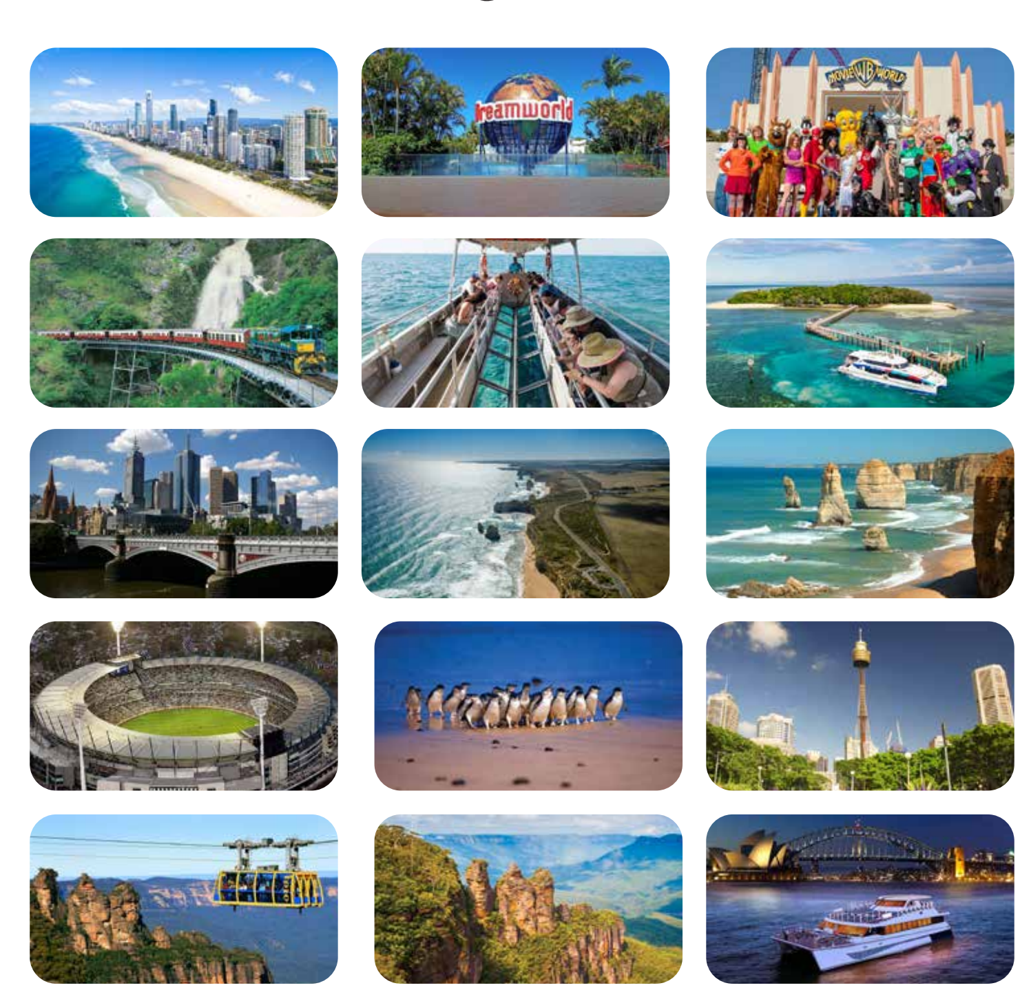
We Make Your DREAMS TRUE